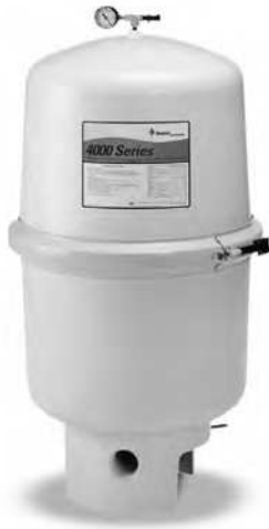
SMBW 4000 Series Filter

Sheet molded fiberglass tank, 2 in. threaded female connections with Noryl® rotary backwash valve.